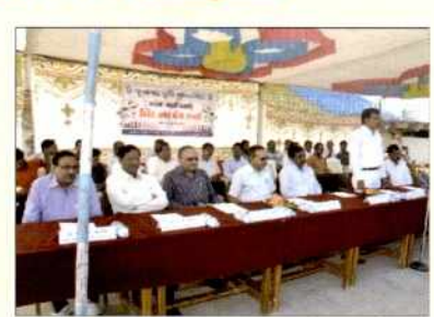
Inauguration Ceremony of Inter Collegiate "Cricket and Chess Tournaments

In ter Collegiate Cricket and Chess tournaments of JAU were organized by PGIABM during October 19-20, 2013 at University Sports Complex, JAU, Junagadh. The tournament was inaugurated by Chief Guest of the function,