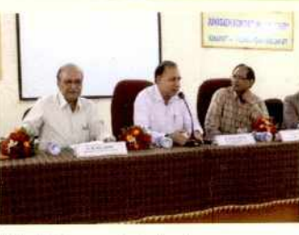
Shri Babubhai Bokhiria, Hon'ble Minister of Agriculture, Govt. of Gujarat Inaugurated and addressed the SAC Meeting at KVK, Khapat