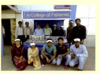
Inauguration of Sea Food Event - 2013 and Stalls of Products of Fisheries at College of Fisheries, JAU, Veraval